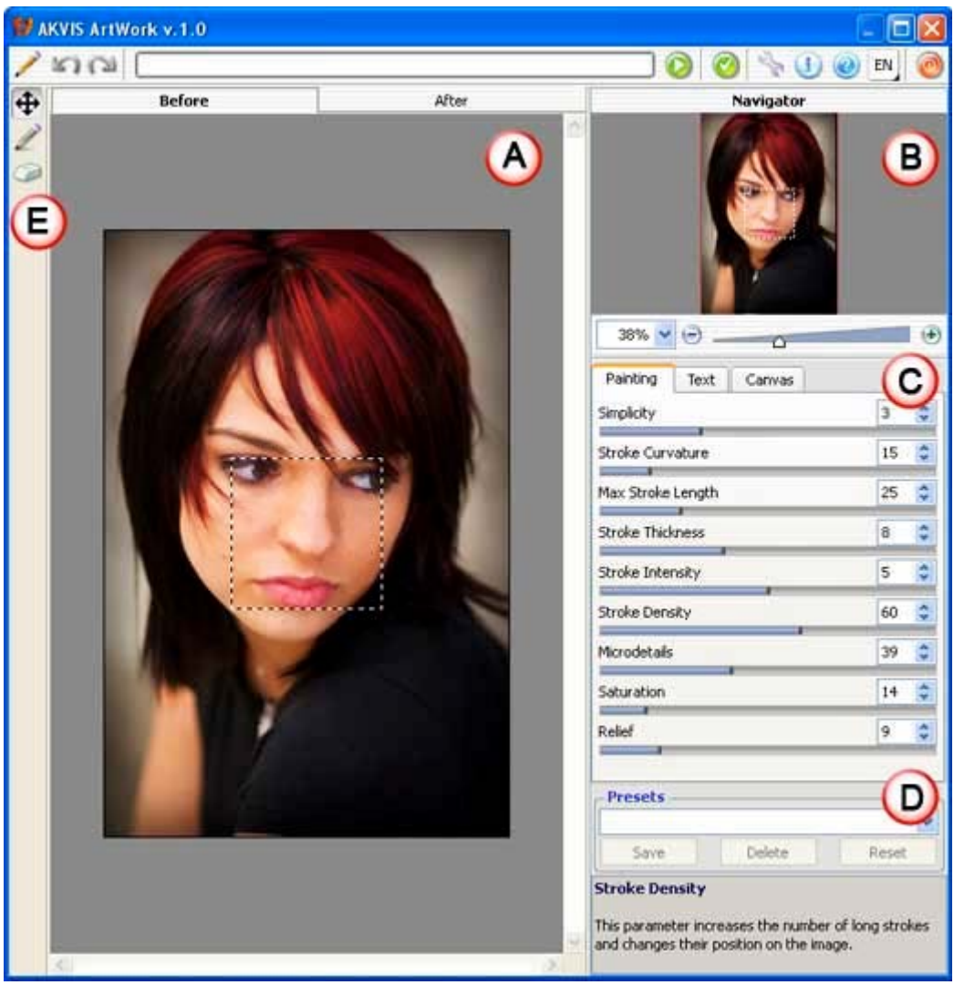
Figure 2: AKVIS ArtSuite interface